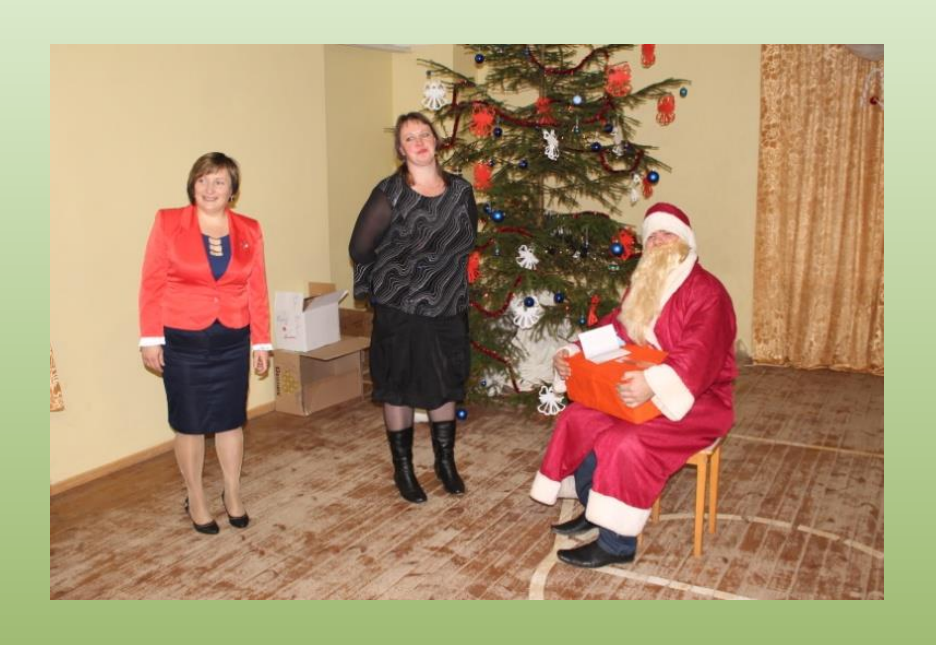
Presents for staff.