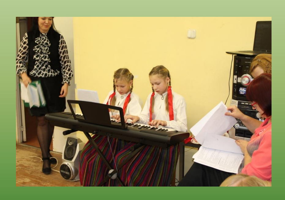
Two sisters are playing the piano.