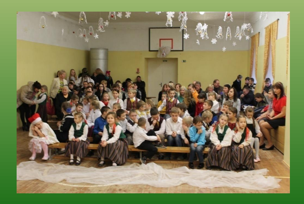
Christmas father is leaving.